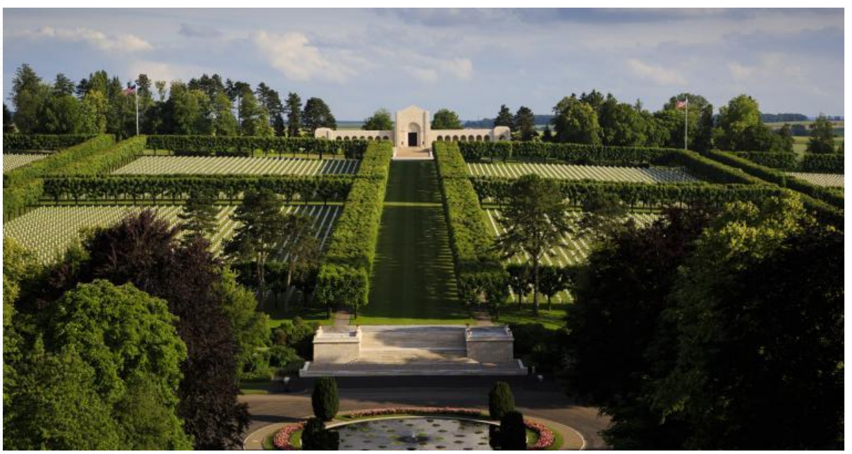
Meuse-Argonne American Cemetery, France