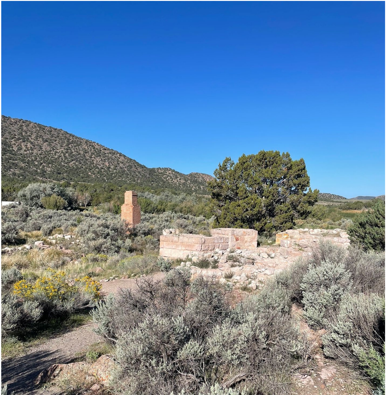
Ruins at Old Iron Town