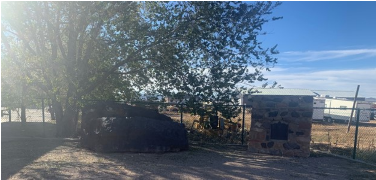
50-ton piece of magnetite ore from the Iron Mines next to the Fort Cedar Monument

Longitude: -113.08; Latitude: 37.688333; Elevation 5,710'; DUP-222_CC-9; west I-15, south Industrial