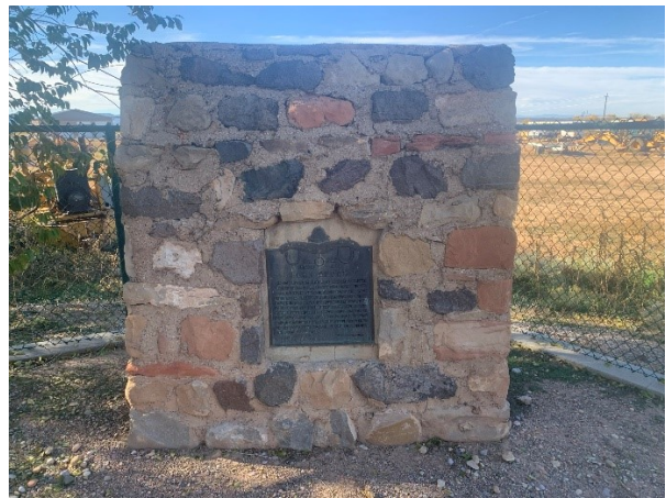
Close-up on the magnetite ore and the Fort Cedar Monument